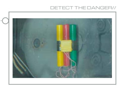
DETECT THE DANGER//